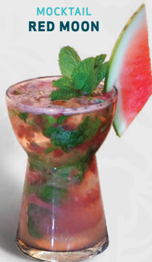
MOCKTAIL RED MOON