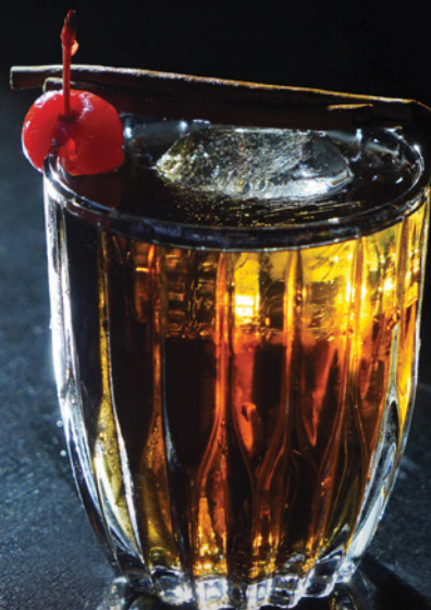
SIGNATURE COCKTAILS OLD CURE