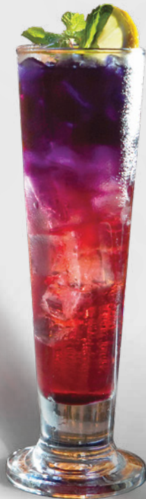
HOW SWEET IT IS QUEEN COOLER