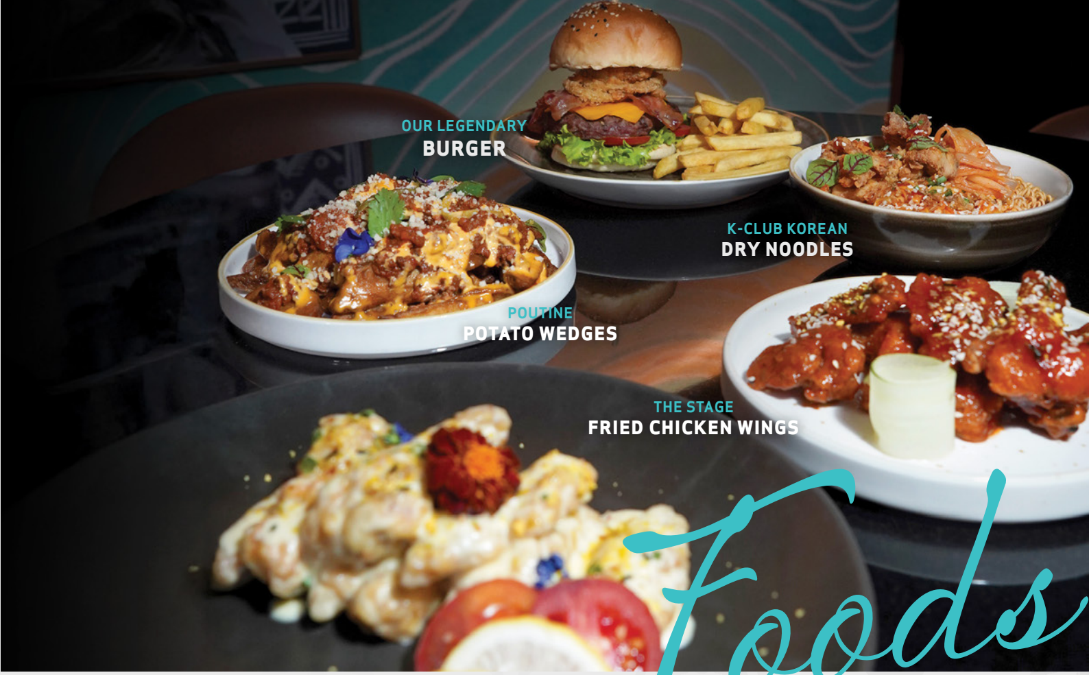
OUR LEGENDARY BURGER