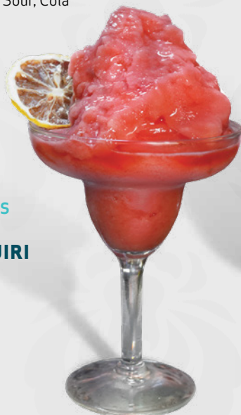
CLASSIC COCKTAILS STRAWBERRY FLAVORED DAIQUIRI