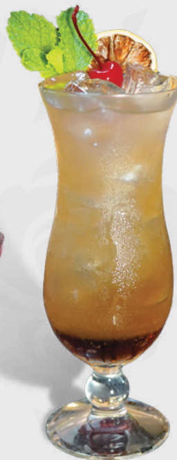
CLASSIC COCKTAILS LONG ISLANDS ICE TEA