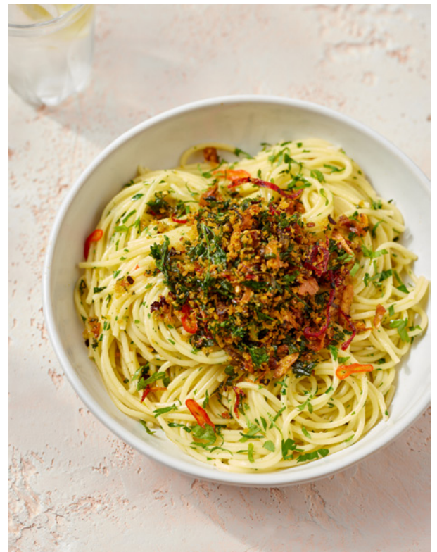
SPAGHETTI AGLIO E OLIO

V – Vegetarian | VG – Vegan Option | GF – Gluten Free