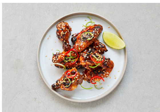
STICKY TERIYAKI WINGS