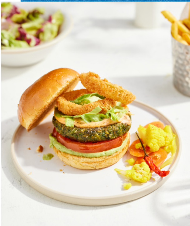
NEXT-LEVEL VEGGIE BURGER

All burgers served with your choice of Fries | Charred broccoli