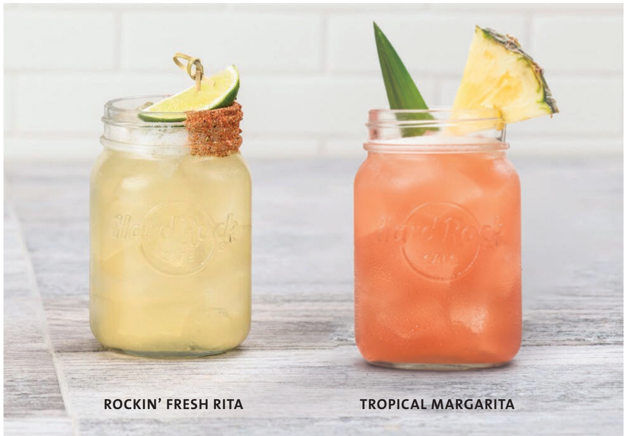
ROCKIN' FRESH RITA

Smirnoff Vodka, Bacardi Superior Rum, Beefeater Gin and Blue Curaçao with sweet & sour and topped with Red Bull®. US$ 10