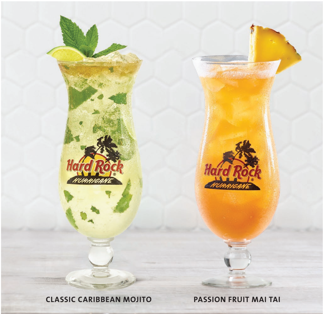
CLASSIC CARIBBEAN MOJITO